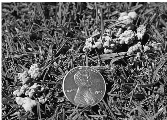
Figure 3. An excellent indicator of a healthy soil is the existence of earthworms or earthworm castings.

Applying carbohydrates and proteins, ingredients usually not included in many synthetic fertilizers, is part of a “feed the soil” philosophy. Maintaining a balanced, healthy soil system ensures that the essential nutrients we apply are used efficiently (Figure 3).